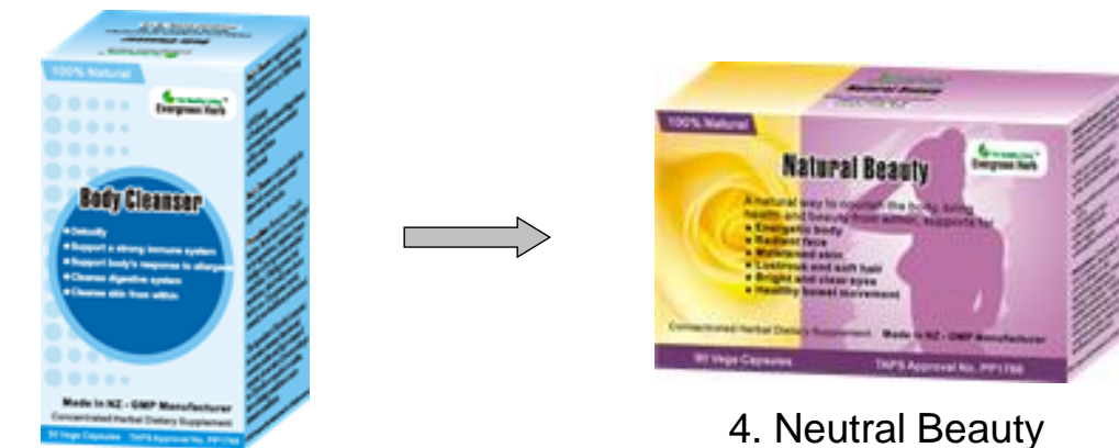
3. Body Cleanser