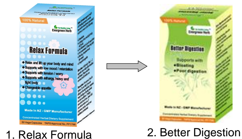
1. Relax Formula

The second stage – cleanses and nourishes the body to effectively bring health and beauty: